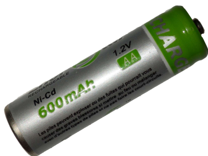
Figure 1: battery

Ut varius urna velit, a iaculis leo pellentesque a. Fusce id faucibus mauris, in pulvinar sapien. Morbi tortor elit, efficitur tempus consequat id, rhoncus sit amet turpis. Maecenas eget libero mi. Suspendisse sem urna, laoreet nec nulla non, convallis porttitor velit. Suspendisse eu tincidunt quam. Nullam vulputate elit sapien, eget finibus urna tempor eget. Cras imperdiet ipsum blandit aliquam suscipit. Curabitur rhoncus lobortis est nec laoreet. Donec volutpat neque leo, sed ultrices erat tristique vel. Praesent sit amet ultrices sem, sed molestie neque. Vestibulum ante ipsum primis in faucibus orci luctus et ultrices posuere cubilia curae; Curabitur in ligula justo. Quisque nec suscipit metus, ornare placerat ex.